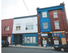
In 2005, HANDS' Valley plan would become the first in the state to receive NRTC funds.