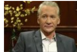
LARRY KING NOW

Bill Maher speaks about Obama's disappointments & Paul Ryan's "Taxi Driver" morals